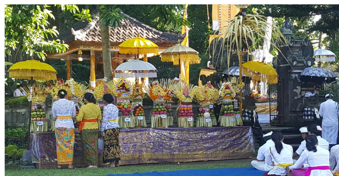
Personal Collection, Sarasvati Celebration, Bali (January 2016)